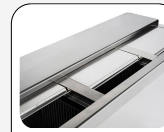
Stainless steel sliding doors with grab handle