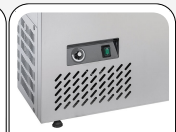
Independent main switch and knob for temperature regulation