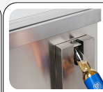
Bottle opener included