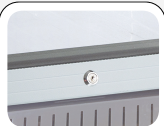
Lock fitted as standard