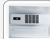
Inner digital thermometer