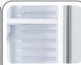
Inner vertical LED light