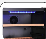
Led LED light (BLUE Color)