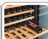
Sliding wooden shelves