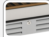
Lock fitted as standard