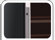
External cylindric handle in stainless steel