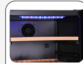
Led LED light (BLUE Color)