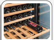
Sliding wooden shelves