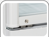
Lock fitted as standard