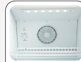
Inner assistance fan