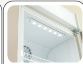
Inner LED light