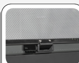
Nightblind (Fabric - Grey color)