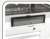
Easily acces for clean condenser filter