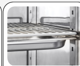
Multi functional set of guide ("E" form)