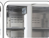
Inner vertical LED light