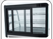
Rear sliding doors