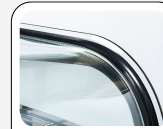
Lateral and frontal curved glasses