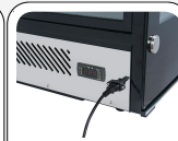
Stainless steel basement with digital controller