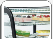
Inner LED light