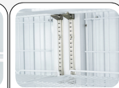
Hot gas defrost system