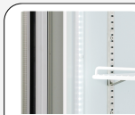
Inner vertical LED light