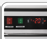
Main switch, light switch and digital thermostat fitted as standard