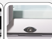
Lock fitted as standard