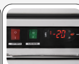
Main switch, light switch and digital thermostat fitted as standard