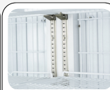
Hot gas defrost system