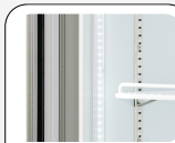
Inner vertical LED light