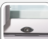
Lock fitted as standard