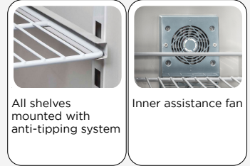
All shelves mounted with anti-tipping system