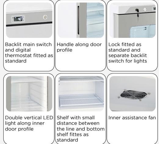
Backlit main switch and digital thermostat fitted as standard